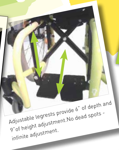
Adjustable legrests provide 6" of depth and 9" of height adjustment. No dead spots - infinite adjustment.

Room for Growth The Quickie RX Kidz can grow with the child. It features infinitely adjustable legrests and footplates and an optional 2.5cm or 5cm seat depth growth kit.