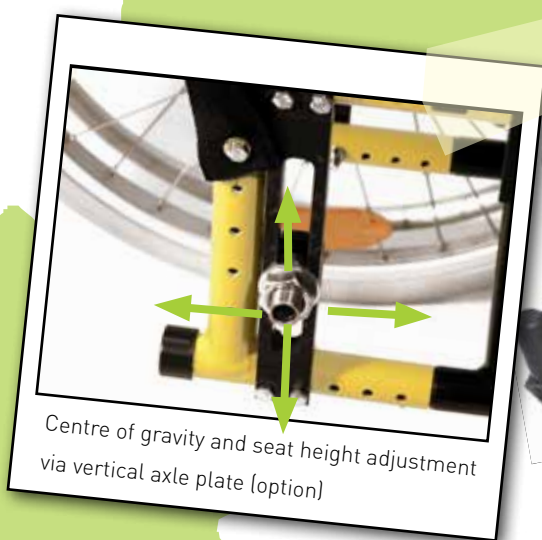
Centre of gravity and seat height adjustment via vertical axle plate (option)