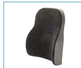
Deep contour backrest