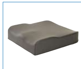
Optimum comfort cushion