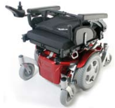
Lift-off backrest for easy transportation and storage