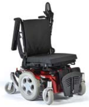
Flip-up armrests and foot rests for easy accessibility